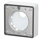
WV-QIB500-W Mount Bracket