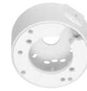
WV-QJB502A-W Mount Bracket