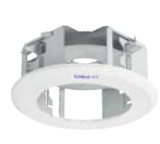
WV-QEM506-W Ceiling Mount Bracket