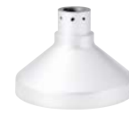
WV-QSR501-W Mount Bracket