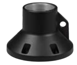
WV-QCL101-B Mount Bracket