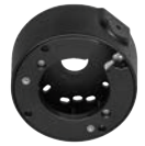
WV-QJB502A-B Mount Bracket