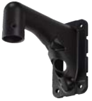
WV-QWL501-B Mount Bracket